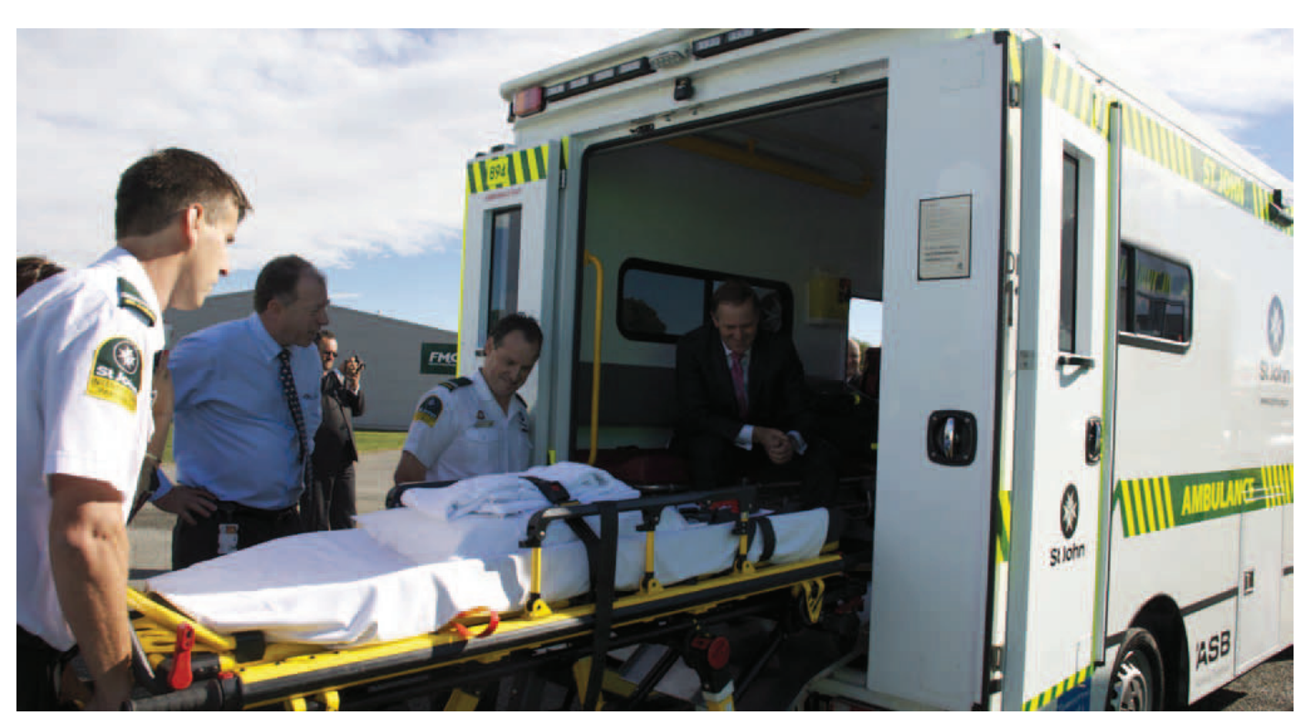
Appeal funds have helped St John to replace emergency equipment lost in the earthquakes.